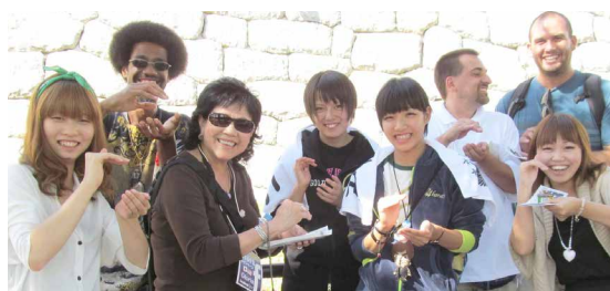
4 missionaries, 4 new friends, 1 silly pose

http://facebook.com/groups/6000milesfor1000friends